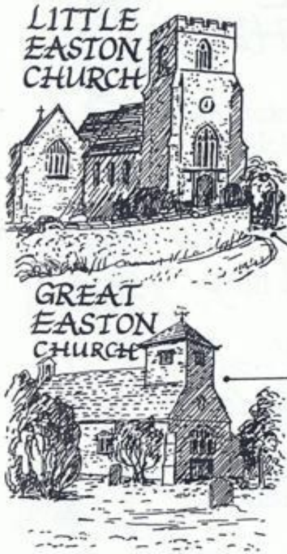
LITTLE EASTON CHURCH