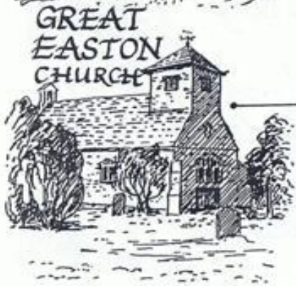
GREAT EASTON CHURCH